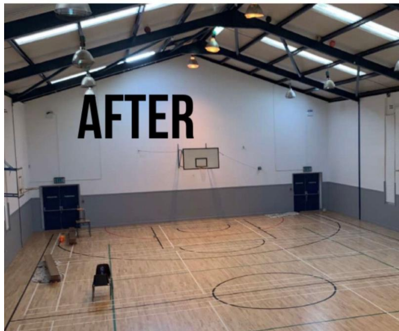
Doneraile Secondary School