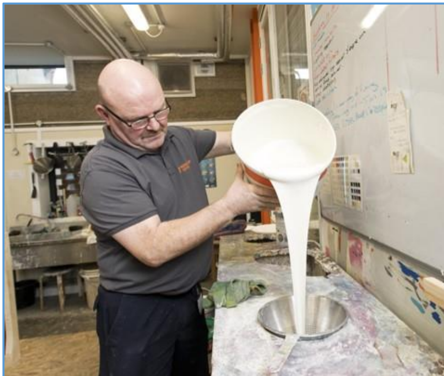
Remixing Paint at the Rediscovery Centre

The Paint Reuse Network therefore provides Local Authorities with a method for dealing with surplus paint while also supporting Ireland's transition to a circular economy and the objectives of social enterprises around the country.