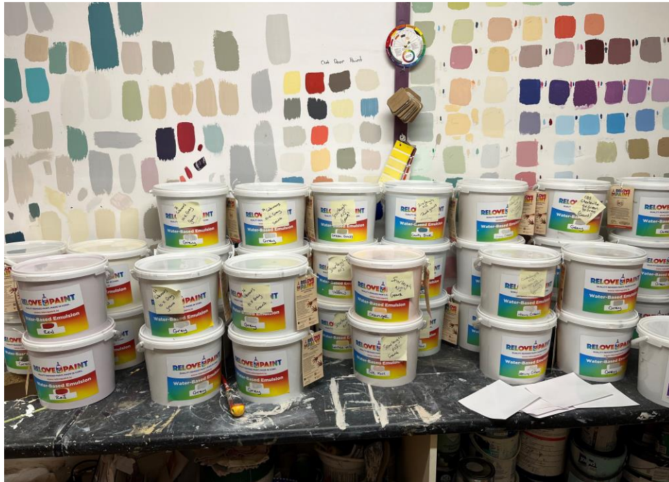
Paint prepared by Northside Community Enterprises in Cork City