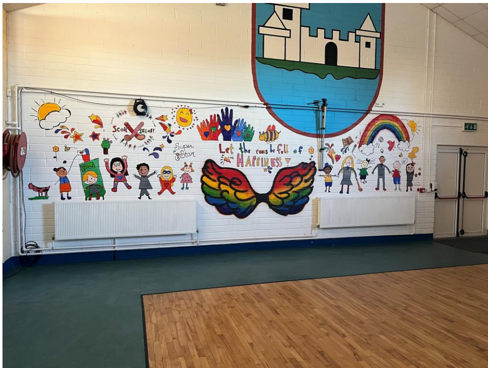
Mural painted in Castlemartyr Primary School